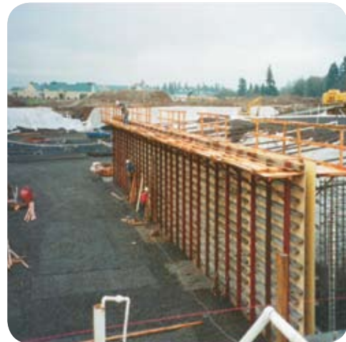
HIGH SCHOOL - VANCOUVER, WA