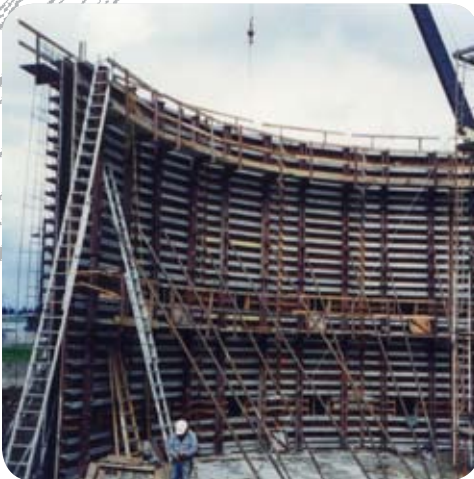
DIGESTER TANK - VANCOUVER, WA