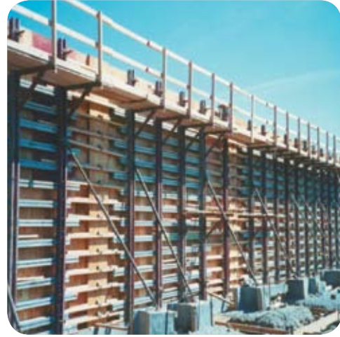
MIDDLE SCHOOL - SALEM, OR

Because Masons has several aluminum beam and waler sizes and three capacities of ties available for use on the Aluminum Beam Gang Form, a wide variety of beam spacings and tie patterns can be utilized.