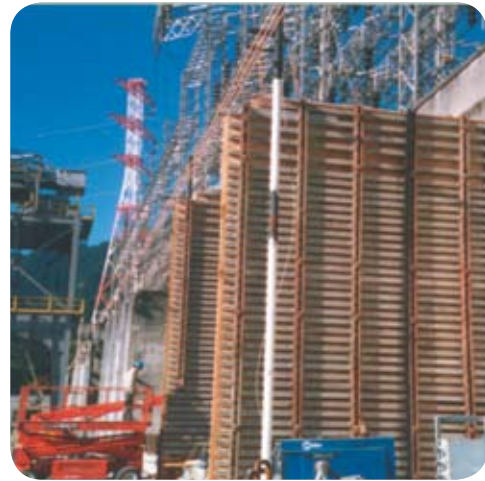
DAM - BONNEVILLE, WA