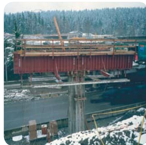
INTERCHANGE - BELLEVUE, WA