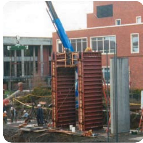
UNIVERSITY - SALEM, OR