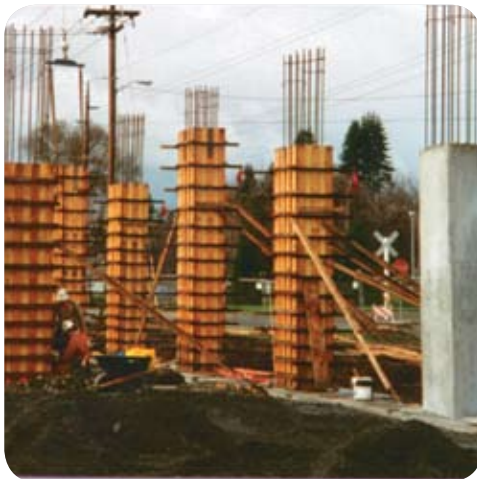
GARAGE - HILLSBORO, OR