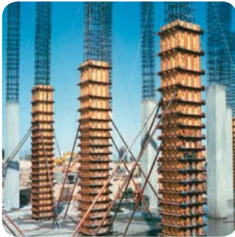
HOTEL - LAS VEGAS, NV

Lock Fast Column Clamps have these advantages; they are job-built, gang formed. There are no loose pieces and they have a minimum of labor costs. They are designed for rapid locking action and fast placement of concrete.